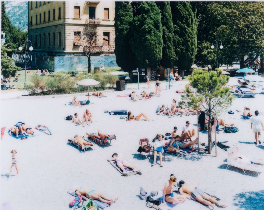
© Massimo Vitali, Torbole, Urban Beach 1, août 1996 Photographie, tirage couleur contrecollé sur aluminium 180 x 220 cm, Collection FRAC Alsace, Sélestat