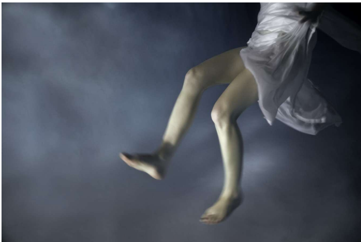
© Rahshia Linendoll-Sawyer, We are not made of wood, 2012, 3 photographies 2 x (152 x 101) cm et 101 x 152 cm, Collection Fondation François Schneider