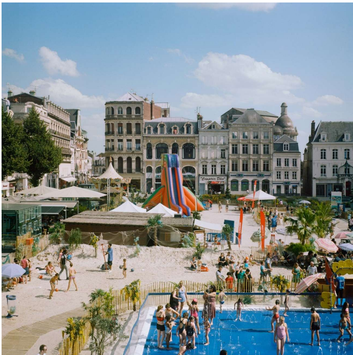
© Céline Diais, Voir la mer, 2015, Photographies 9 x (90 x 90) cm, Collection Fondation François Schneider